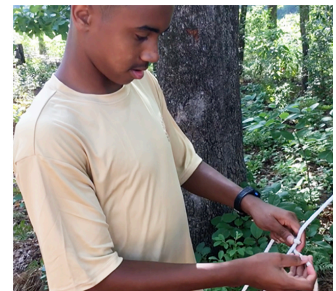
Useful Set of Tools