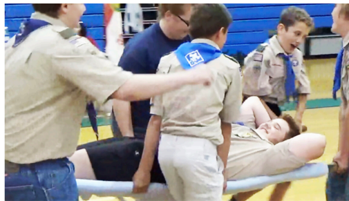
Unique Brand of Fun