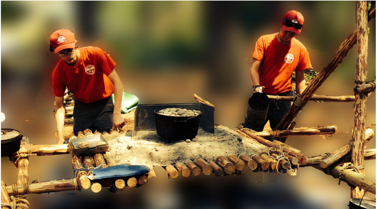
Baking Cobbler on their Chippewa Kitchen to Share with the Public During a Scout Expo

From an elevated vantage point, it can be ascertained that outdoor skills is one of Scouting's major attractions. It would then follow, by impressively demonstrating their outdoor skill prowess in a public setting, Scouts BSA units could experience a positive impact in their effort to recruit new members.