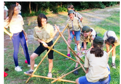
Engagement and Focus