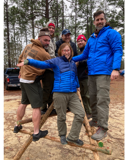
Putting Square and Tripod Lashings into Action during a Creatively-Presented IOLS Session

An updated IOLS training program, providing an activity-based approach to teaching and presenting early rank-required outdoor skills needs to be implemented. Putting these skills into action during training sessions, in ways that illustrate how they are used and providing an opportunity to rely upon them to complete a specific task, brings these skills to life and makes them relevant.