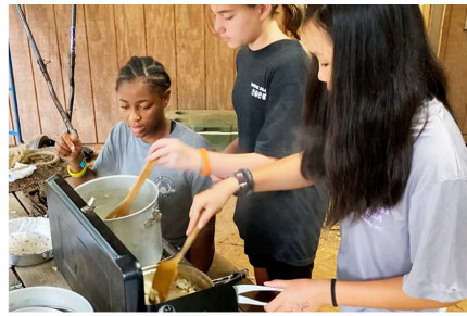
Using One's Resources